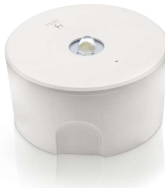
3W Corridor Recessed Downlight (09075V2) Spacing Table